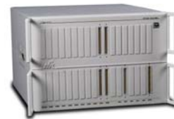
5220 - Benchtop System