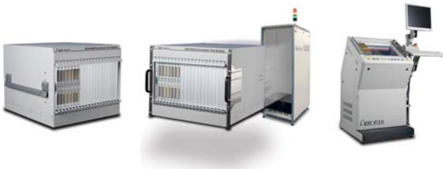
5820 - Benchtop System, 5830 - 19" Rack Mounted, 5850 - Floor Standing