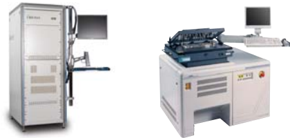
4230 - 19" Rack Mounted, 4250 - Floor Standing